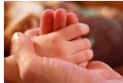
protect the helpless