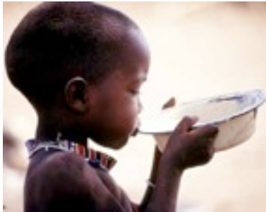
end hunger/provide water