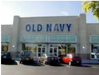
number one teen store