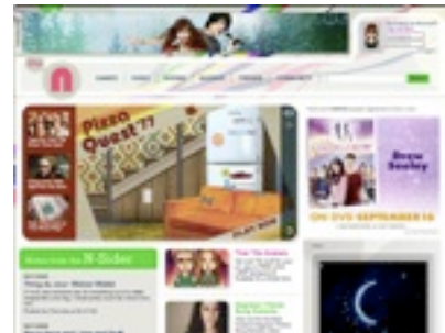
the-n.com (nighttime tv network for teens)