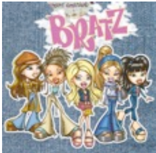
number one tween girl items