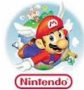
video games: number one tween boy items